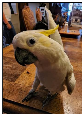
Skipper Lesser Sulphur-Crested Cockatoo

Rehoming fees and adoption policy process apply.