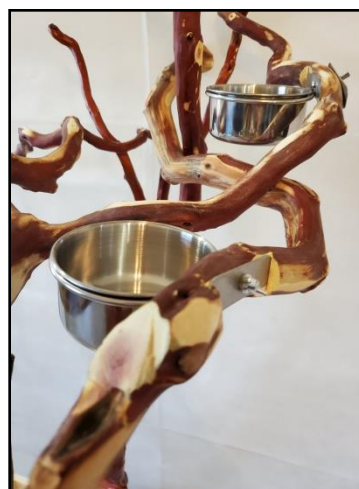
Custom Food Bowl Configuration