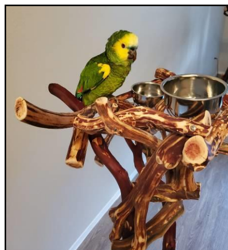
Amazon Enjoying a Beautiful Custom Parrot Stand