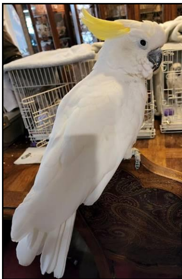
Allie Bird – Eleanora Cockatoo